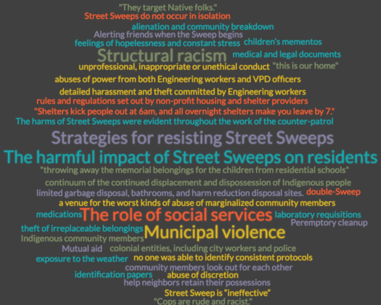
Figure: Emergent overlapping themes and keywords from 1:1 interviews.