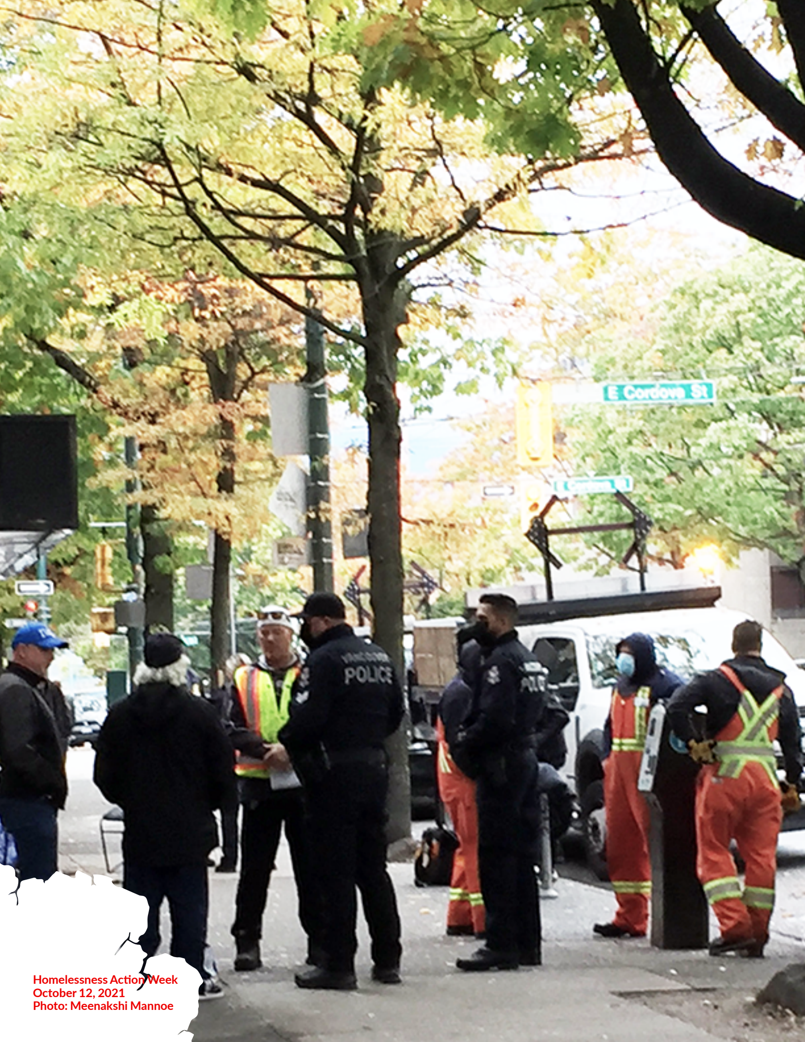
Homelessness Action Week October 12, 2021